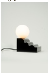
Sitting Moulure wall light